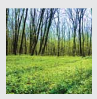
Fully committed to ISO 14001 standards covering all environmental issues