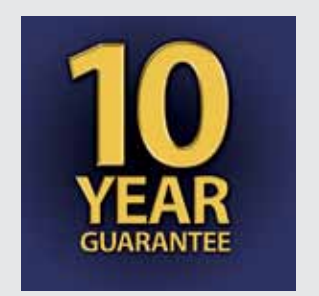
All Spectus products come with a 10 year guarantee