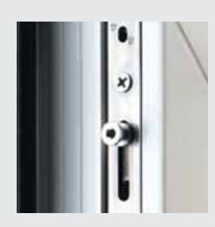
Frames can be customised to meet the highest security standards